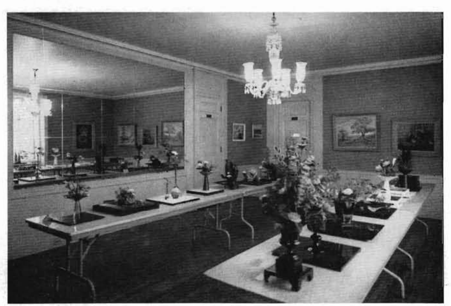
The Hospitality House of Descanso Gardens provides an ideal setting for the Flower Arrangement Show which is held in conjunction with the annual Camellia Show of the Los Angeles Camellia Council.